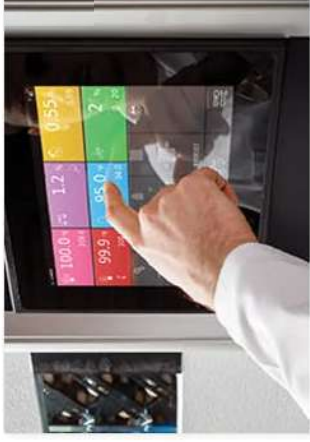
BioStreamer™/ AirStreamerPlus™; OX