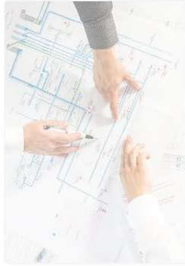
Hatchery climate control