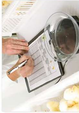
Hatchery management & incubation