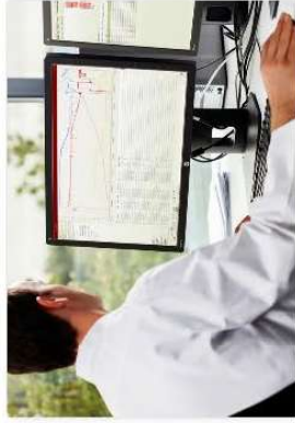
Network & monitoring