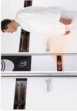
BioStreamer™/ AirStreamerPlus™; Iris